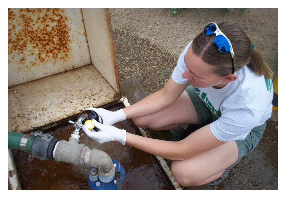
Figure 3. Groundwater sample being collected at monitoring-well head by U.S. Geological Survey employee.