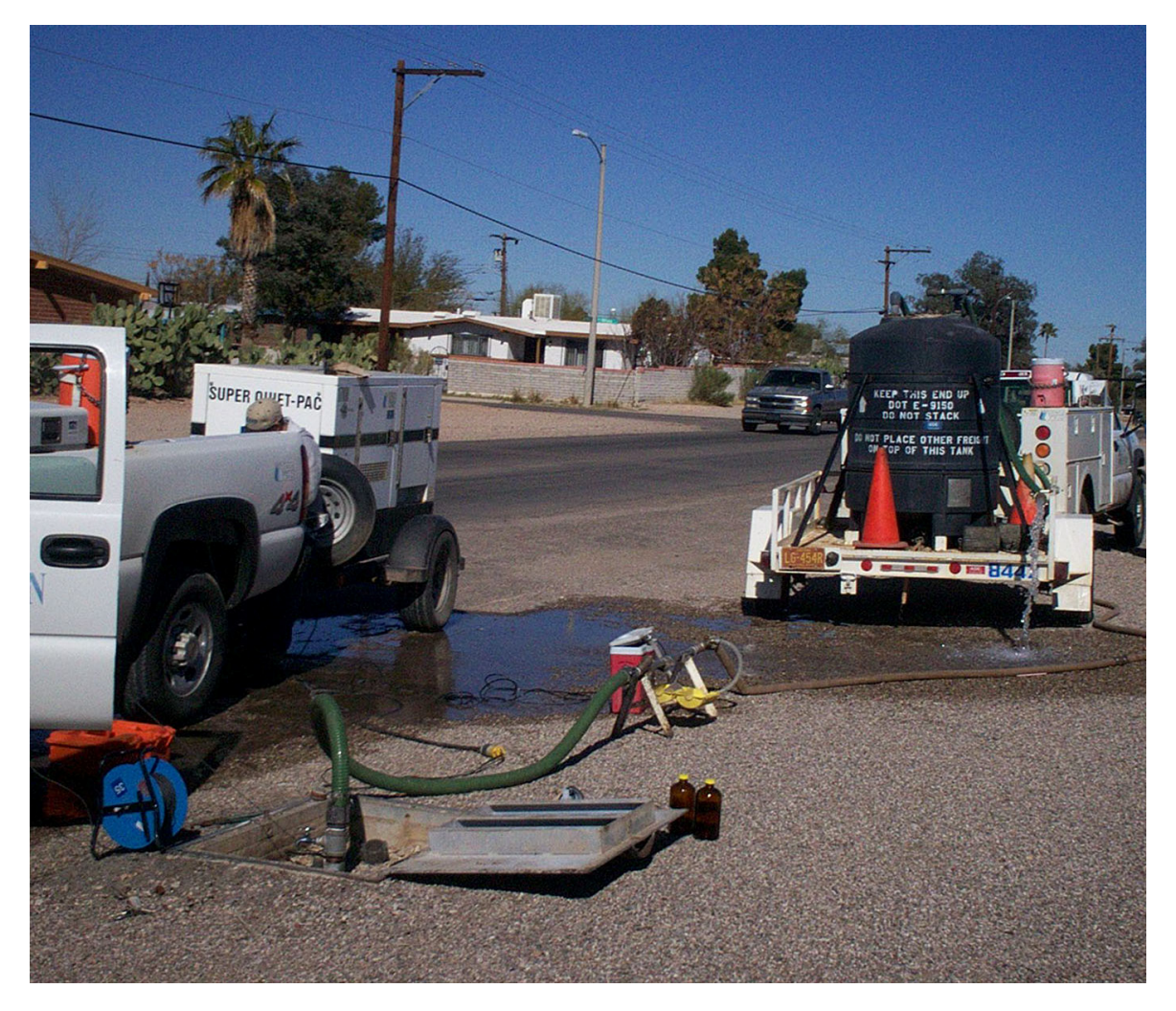
Figure 2. Purging of a TARP-area monitoring well by City of Tucson Water Department personnel prior to groundwater sample collection.

a depth within the reported screened interval of the wells (table 2). Water from a private well in the area was sampled from a wall tap closest to the well location. Neither the well nor the water line were purged prior to sample collection. All samples were packed on ice in the field, refrigerated at < 5 °C, and shipped on ice to the contract laboratory before the expiration of sample holding times. Raw groundwater samples were collected directly into sample bottles; therefore, no equipment blanks were collected or analyzed during sampling rounds.