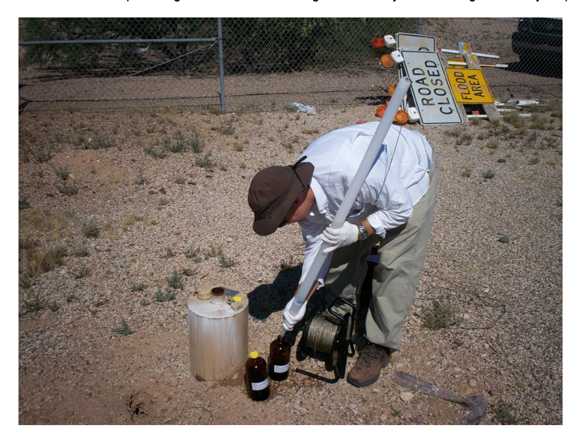
Figure 4. Sample bottles being filled by U.S. Geological Survey employee with groundwater sample taken from a former supply well by a polyethylene bailer.

Figure 3. Groundwater sample being collected at monitoring-well head by U.S. Geological Survey employee.