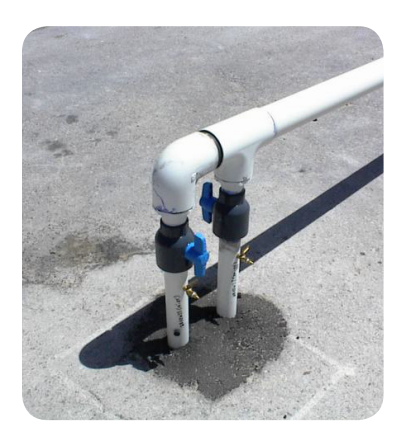
Pipes transport vapors from the underground SVE extraction well to treatment.

SVE and air sparging are efficient ways to remove VOCs above and below the water table. Both methods can help clean up contamination under buildings, and cause little disruption to nearby activities when in full operation. SVE and air sparging are often used together. SVE and air sparging are being used or have been selected for use at approximately 285 and 80 Superfund sites, respectively.