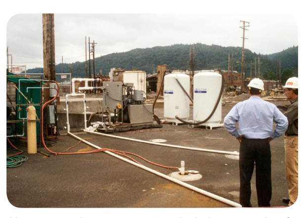
Above-ground treatment system includes two tanks of activated carbon.