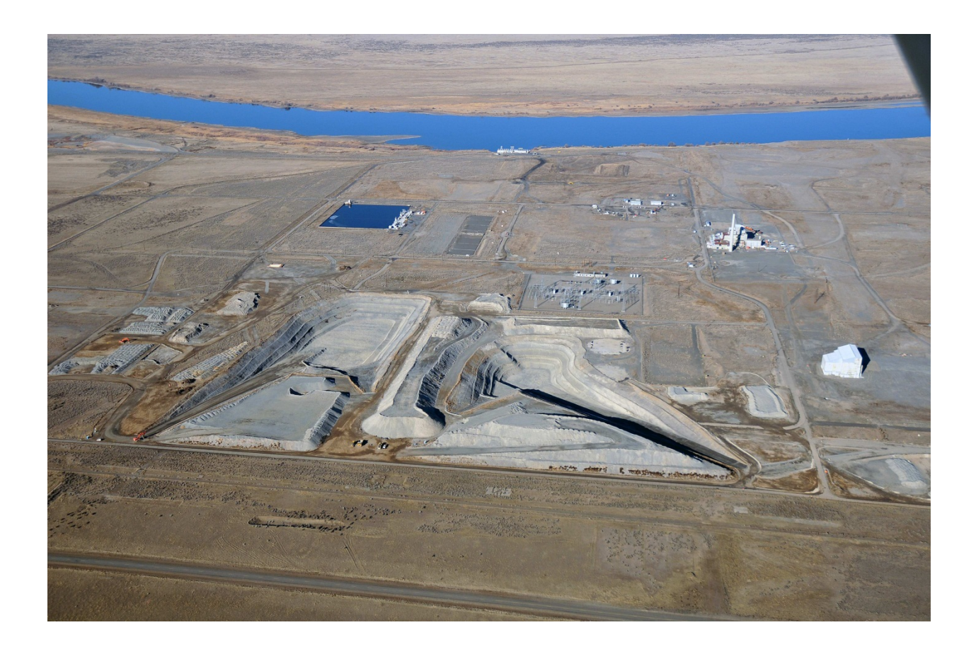
Figure 1: 100-C-7 and 100-C-7:1 Aerial View, January 2012.