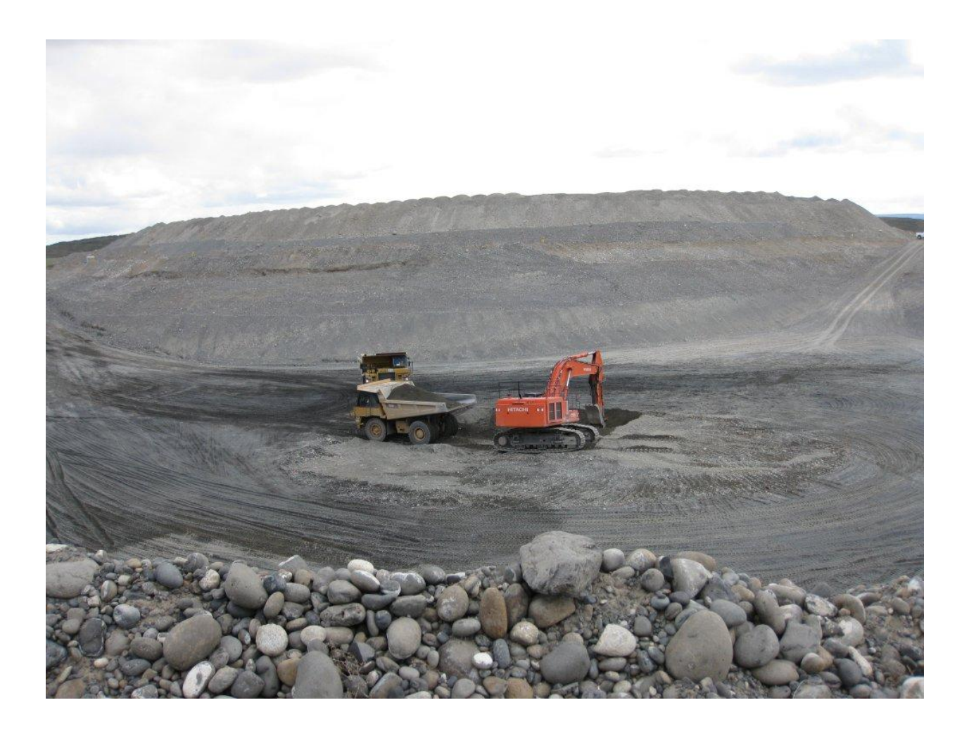
Figure 2: Excavation to groundwater at 100-C-7.